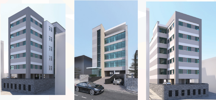
Artistic impression of the proposed redevelopment of Plot 42, Bukoto Street