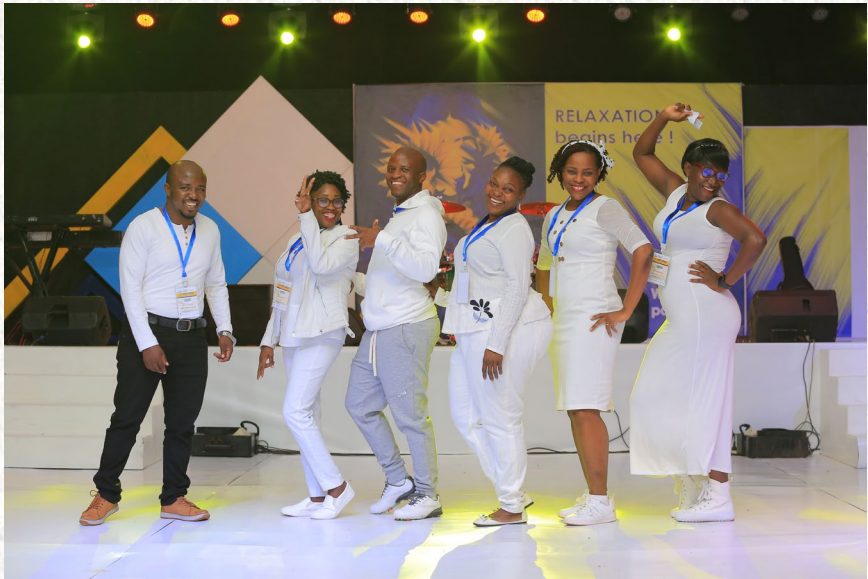
It was all smiles at the all white dinner on day 1 of the 28 th Annual Seminar