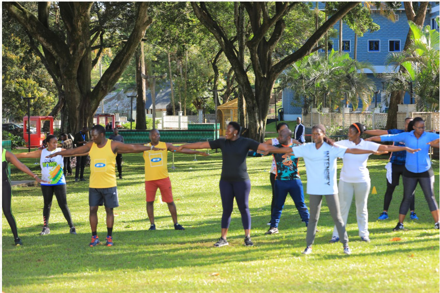
Participants enjoying the some of the recreational activities at the Seminar.