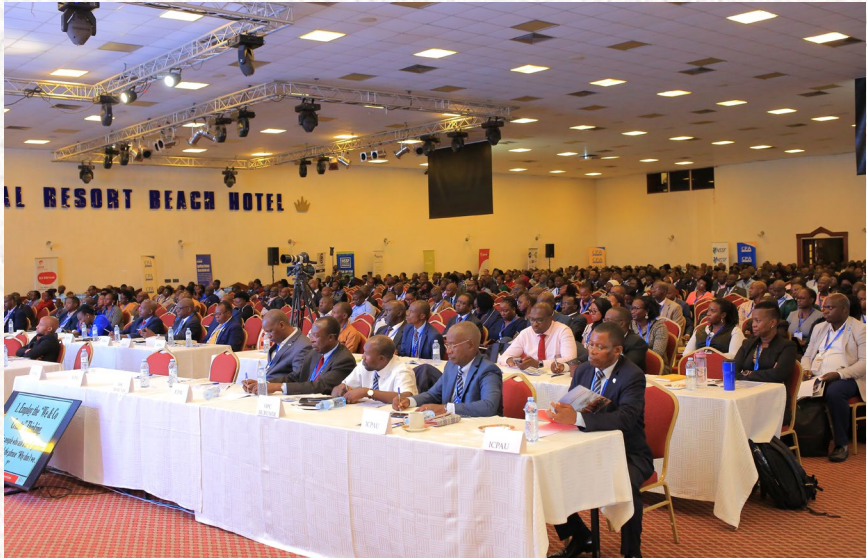
Participants pay keen attention during the 28 th Annual Seminar